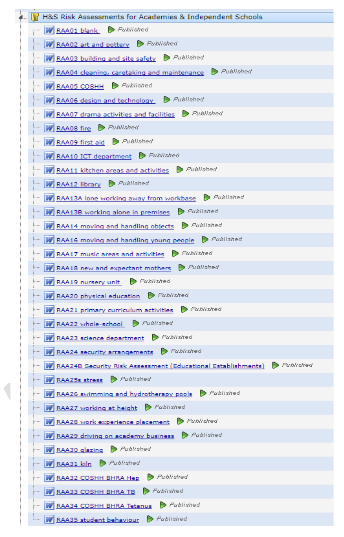
It is accepted that not all the risk assessments will apply.