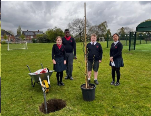
Reception children did a litter pick on Earth Day