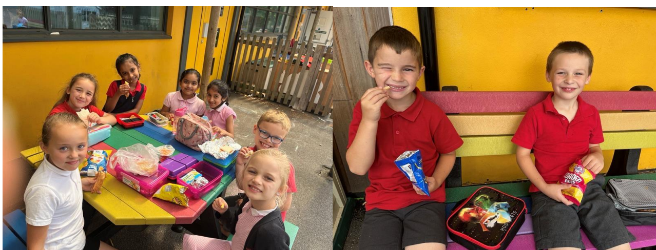
Warm weather = packed lunch picnics outside 🌻