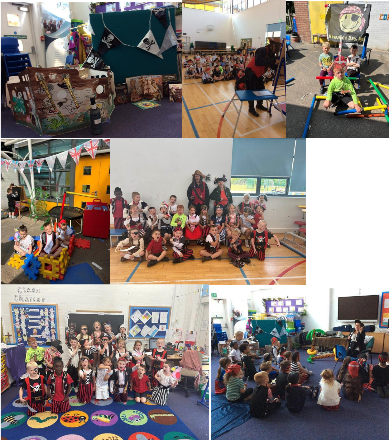
Year 1 and 4 had a great Pirate Day.