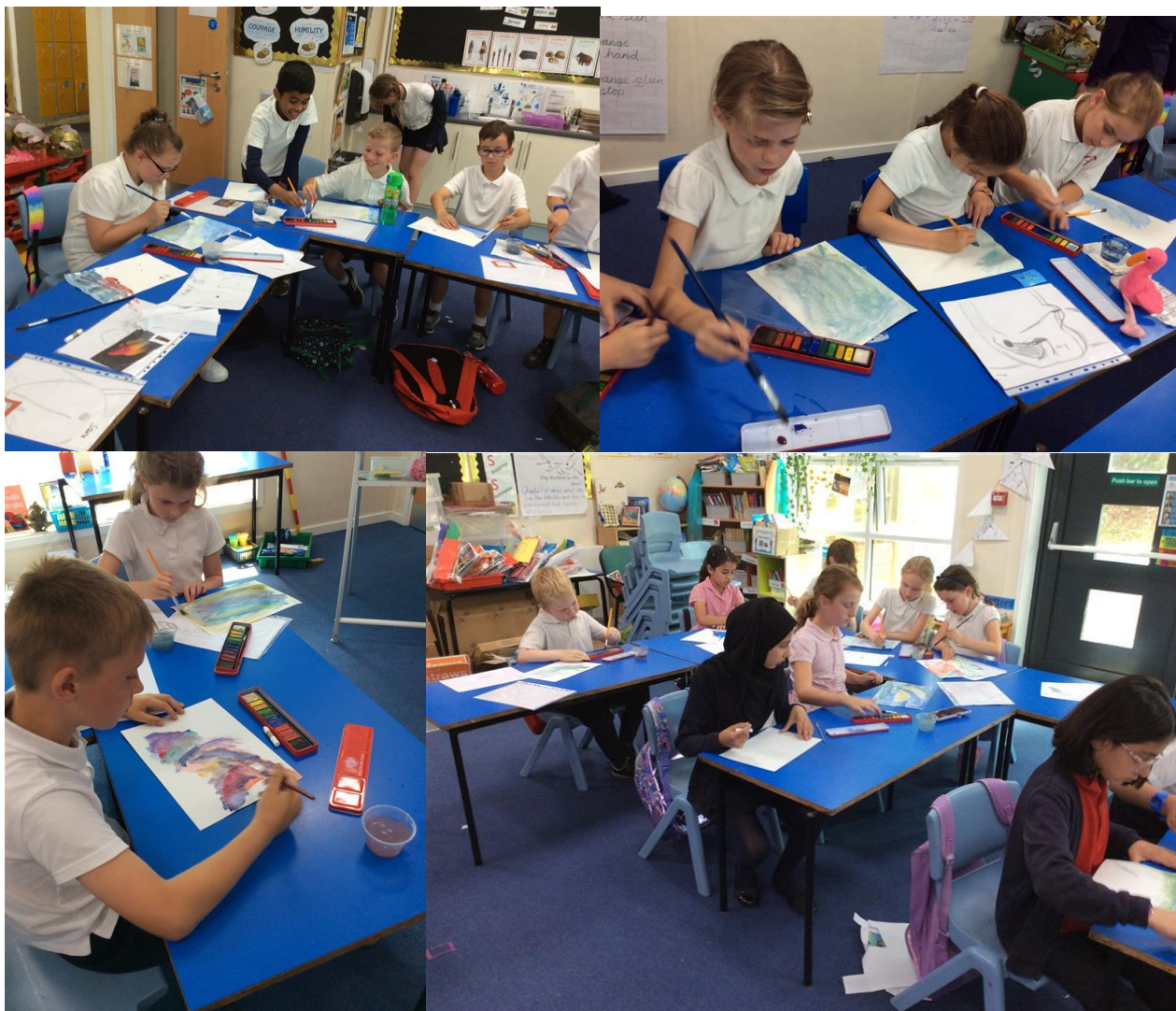
Art Club have finished up the year with some wax resist watercolour painting of sea animals! 😊