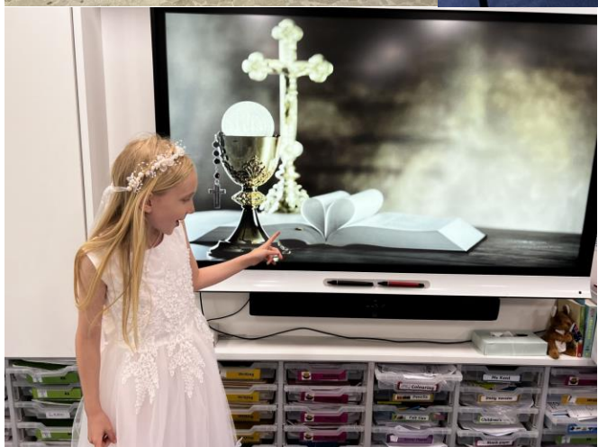
Congratulations to our children in Year 3 and 4 who made their First Holy Communion this month. We also celebrated with a mass in school and a lovely party afterwards.