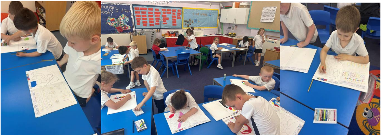
Lessons in Arts Week